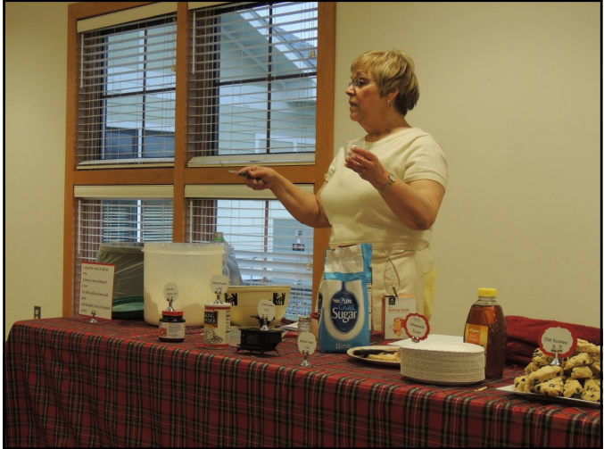
...and a pinch of marmite