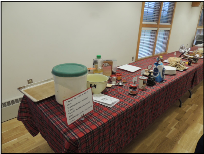
A bonnie spread for sampling