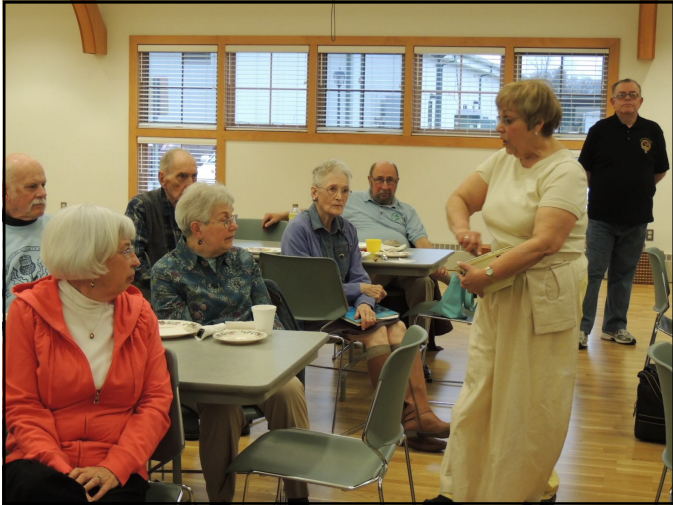
And stir, and stir, and it looks like this